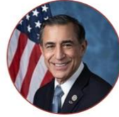
The Hon. Darrell Issa Member of Congress, CA-50 U.S. House of Representatives