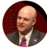
Benjamin Ousley Naseman Consul General at U.S. Embassy Athens, Greece U.S. Department of State