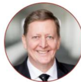
Jamie Holcombe Chief Information Officer United States Patent and Trademark Office