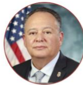
Pete Flores Acting Deputy Commissioner U.S. Customs and Border Protection